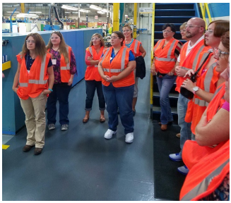
Leadership Montcalm is . . .