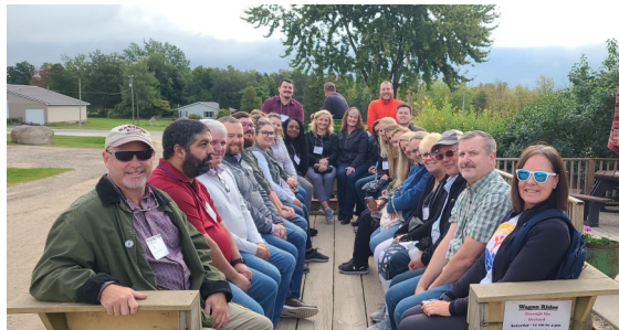
Leadership Montcalm XXIV participants at the Anderson and Girl’s Orchard during the county tour.

Leadership Montcalm has been building leaders since 2000.